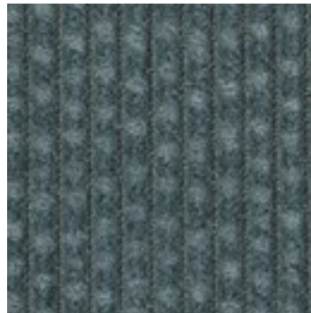
04377.005 OLD GREEN