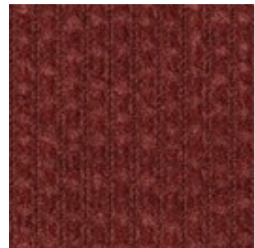
04377.006 DARK ROSE