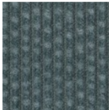
04377.005 OLD GREEN