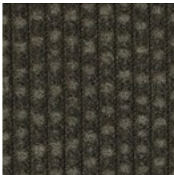
04377.004 ARMY GREEN