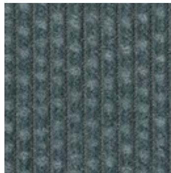
04377.005 OLD GREEN