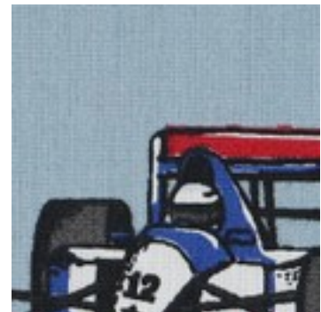
06041.007 LIGHT BLUE