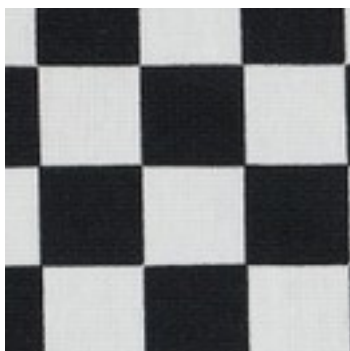
06041.011 FINISH FLAG BLACK WHITE