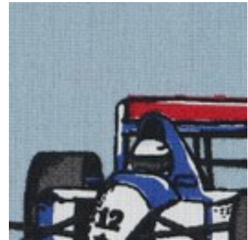
06041.007 LIGHT BLUE