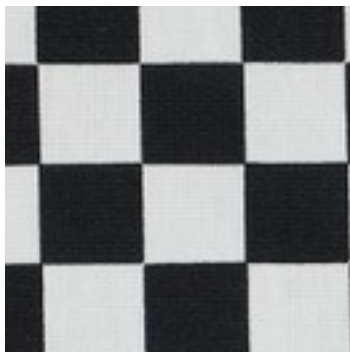
06041.011 FINISH FLAG BLACK WHITE