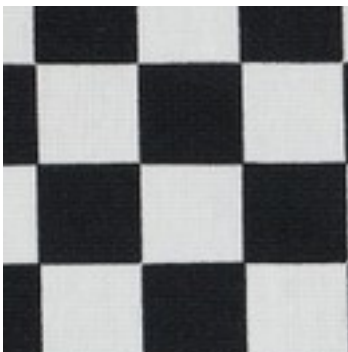
06041.011 FINISH FLAG BLACK WHITE