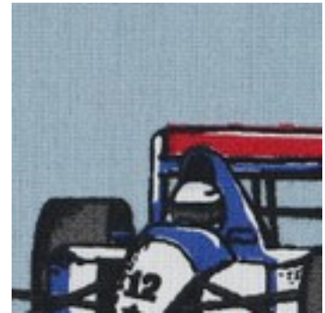
06041.007 LIGHT BLUE