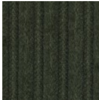
04358.005 ARMY GREEN