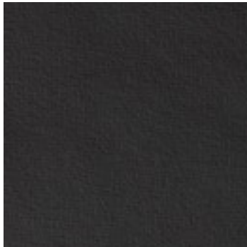
04311.001 METALLIC BLACK/BLACK