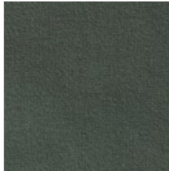
04311.002 METALLIC GREEN/ BLACK