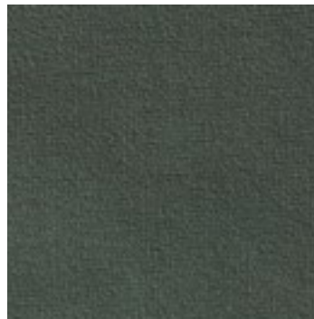
04311.002 METALLIC GREEN/ BLACK