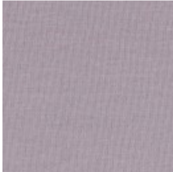
04235.017 CHERRY BLOSSOM