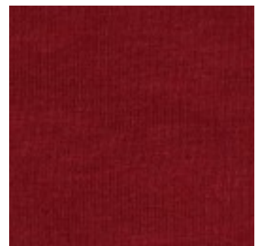
04235.016 WINE RED