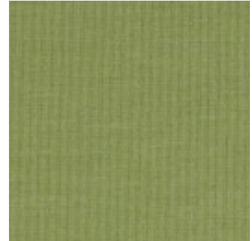
04235.019 OLD LIME