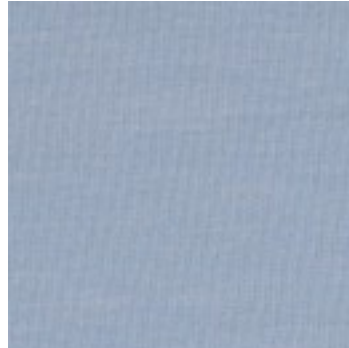
04235.018 LIGHT LAVENDER