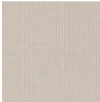
04235.005 LIGHT SAND