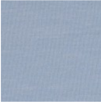
04235.018 LIGHT LAVENDER