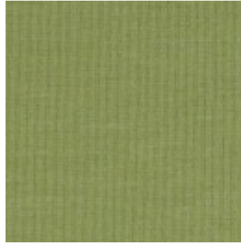
04235.019 OLD LIME