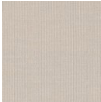
04235.005 LIGHT SAND