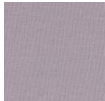
04235.017 CHERRY BLOSSOM