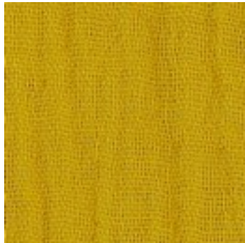
03959.023 DARK YELLOW