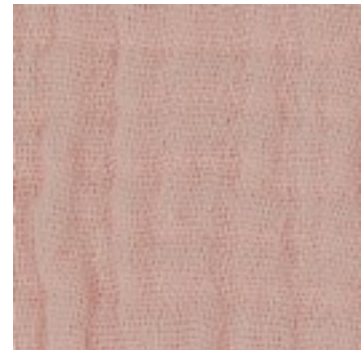
03959.007 OLD ROSE