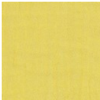
03959.026 SOFT YELLOW