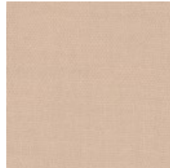
03959.025 LIGHT SALMON