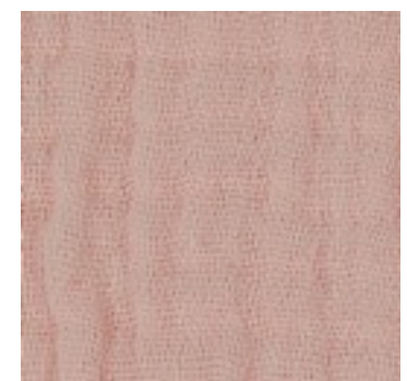
03959.007 OLD ROSE