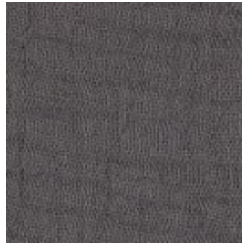
09959.002 DARK GREY