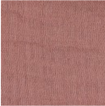
09959.048 OLD BLUSH