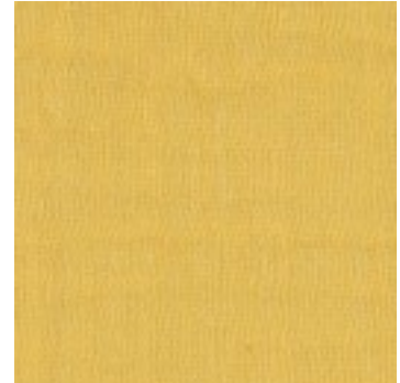
09959.026 SOFT YELLOW