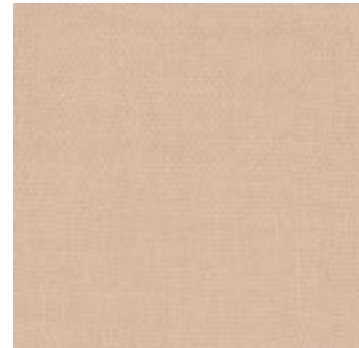
03959.025 LIGHT SALMON