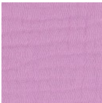
03959.065 LIGHT PINK