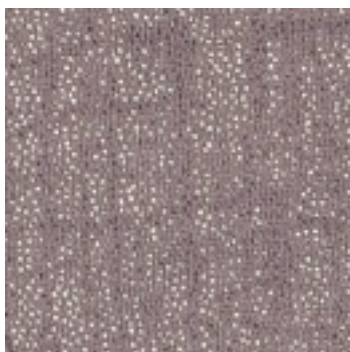
09694.047 DARK POWDER