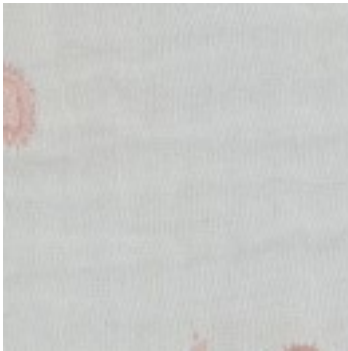
04209.010 OFF WHITE