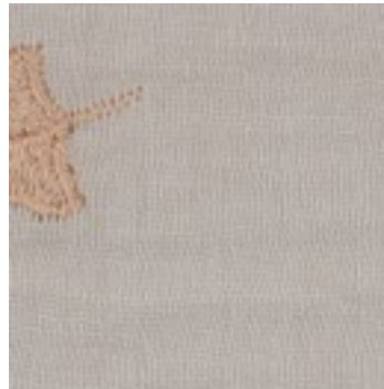
04209.045 LIGHT SAND