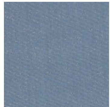
04226.049 LIGHT BLUE