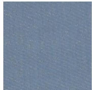
04226.049 LIGHT BLUE