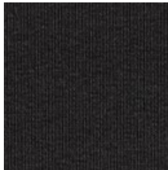
03064.003 DARK GREY