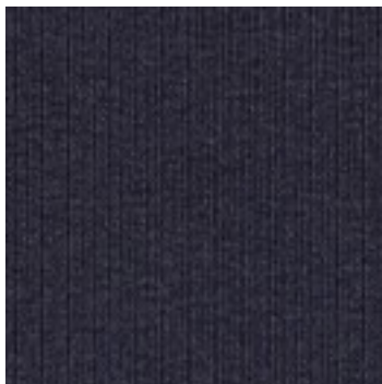
03064.005 DARK BLUE