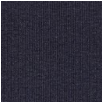
03064.005 DARK BLUE