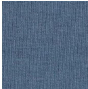
03064.006 BLUE SHADOW