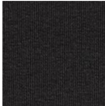
03064.003 DARK GREY