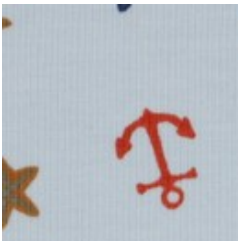
06407.016 LIGHT BLUE