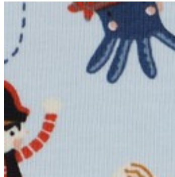
06407.006 LIGHT BLUE