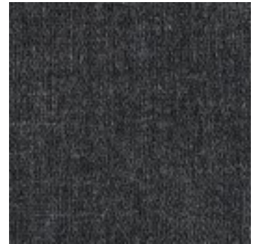
09716.003 DARK GREY MELANGE