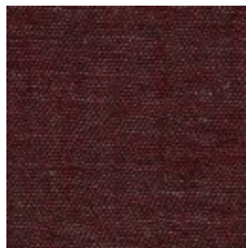
09716.010 BERRY MELANGE