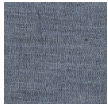
09716.011 JEANS MELANGE