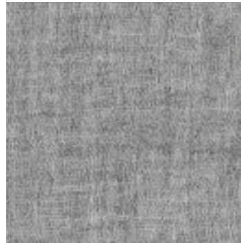
09716.002 LIGHT GREY MELANGE