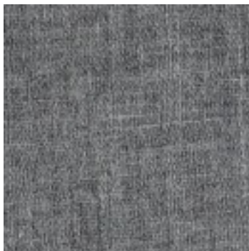
09716.004 GREY MELANGE