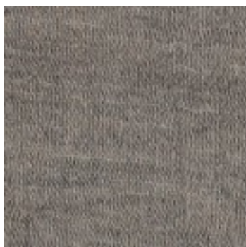
09716.007 TAUPE MELANGE