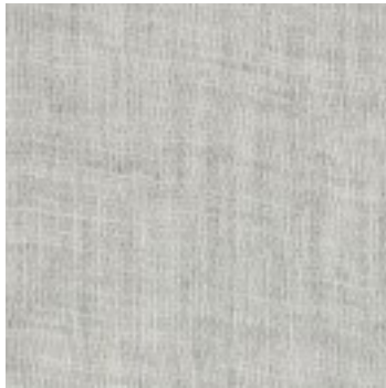
09716.001 ECRU MELANGE