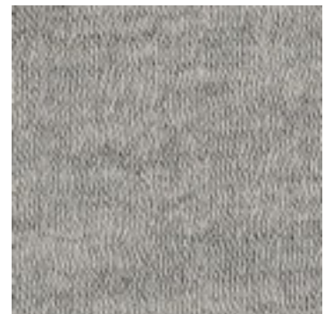
09716.006 SAND MELANGE