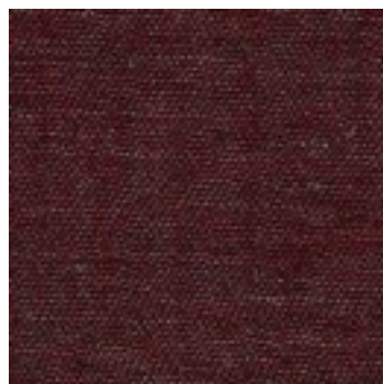
09716.010 BERRY MELANGE