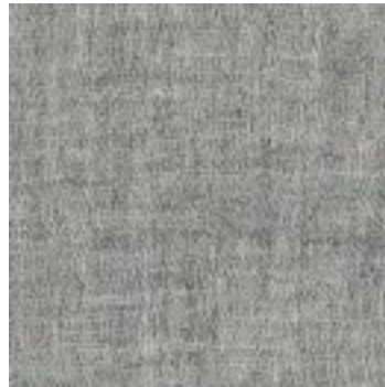
09716.002 LIGHT GREY MELANGE