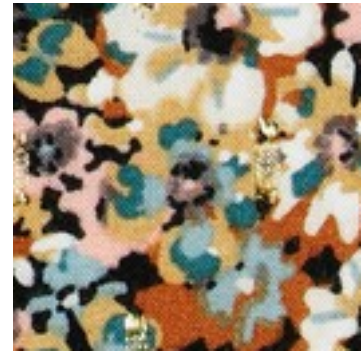
06677.007 BLACK/ HONEY