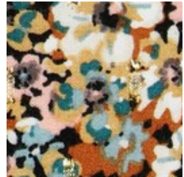
06677.007 BLACK/ HONEY