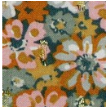
06677.005 DARK CYAN