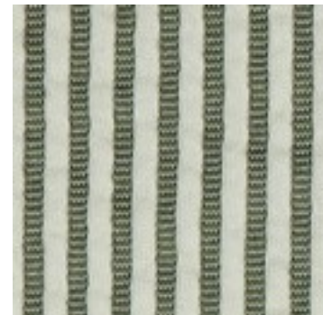
03935.003 ARMY GREEN