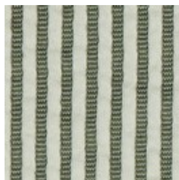
03935.003 ARMY GREEN