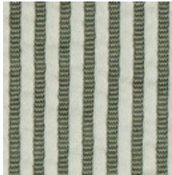
03935.003 ARMY GREEN