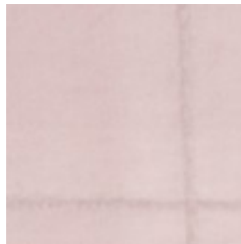
03724.005 LIGHT LILAC