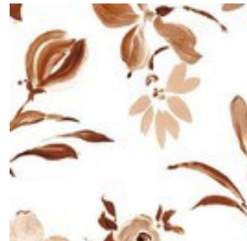
06458.010 WHITE/ DARK APRICOT