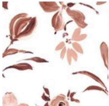
06458.001 WHITE/ MAUVE