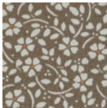
06860.013 MOSS GREEN