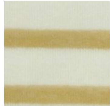
03930.013 ECRU / SAND