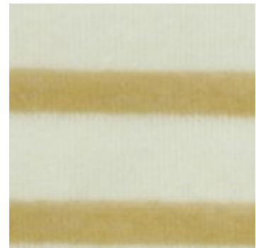
03930.013 ECRU / SAND