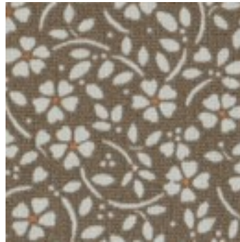
06860.013 MOSS GREEN