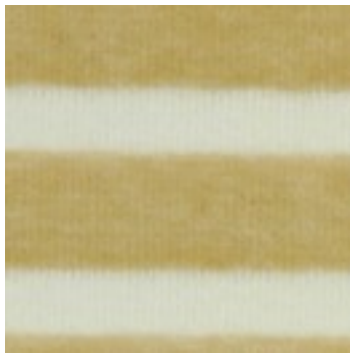
03930.003 SAND / ECRU