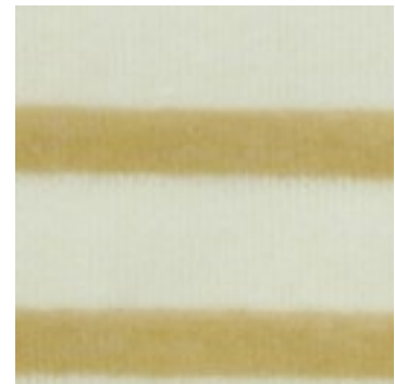
03930.013 ECRU / SAND