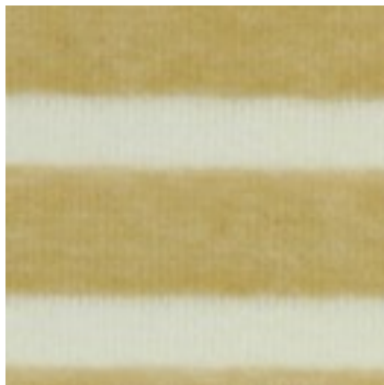
03930.003 SAND / ECRU