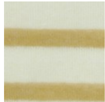
03930.013 ECRU / SAND