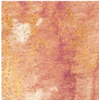
06640.001 SALMON / GOLD