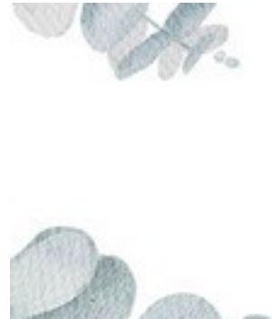
06595.012 WHITE/ BLUE