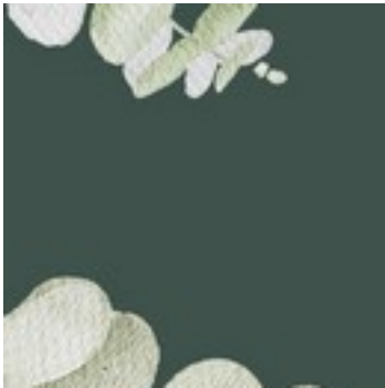
06595.001 DARK GREEN