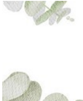
06595.002 WHITE/ GREEN