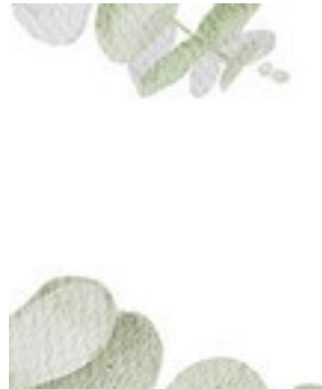
06595.002 WHITE/ GREEN