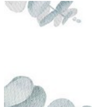
06595.012 WHITE/ BLUE