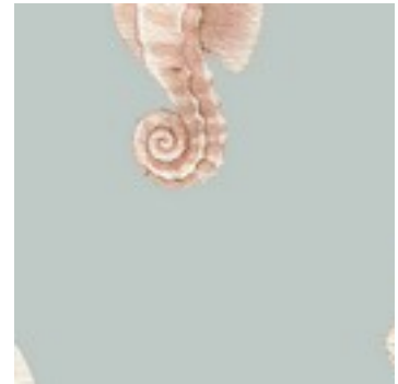
06599.006 LIGHT BLUE