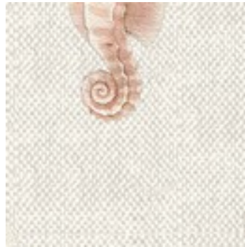
06599.003 LINEN ECRU