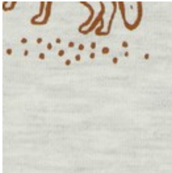
06946.001 ECRU MELANGE