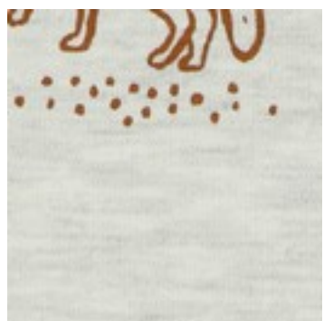
06946.001 ECRU MELANGE