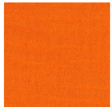
09959.071 ORANGE NEON