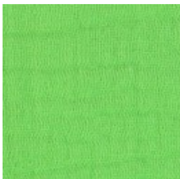
09959.069 LIME NEON