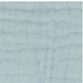
03959.053 BABY BLUE