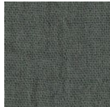
03959.002 DARK GREY