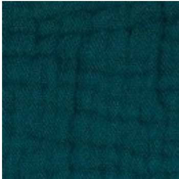
03959.052 DARK CYAN