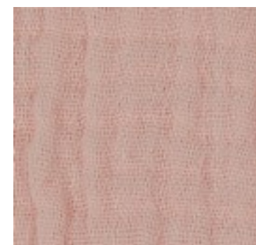
03959.007 OLD ROSE