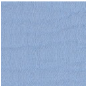
03959.055 LIGHT BLUE