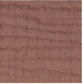
03959.048 OLD BLUSH