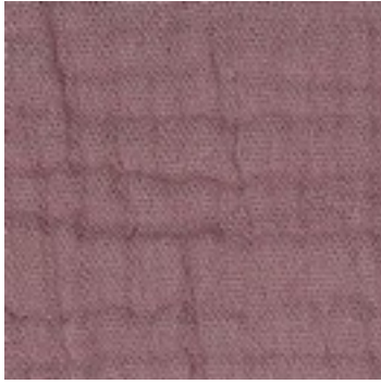
03959.049 LIGHT LILAC