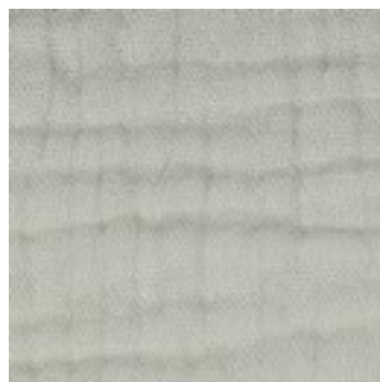
03959.045 LIGHT SAND