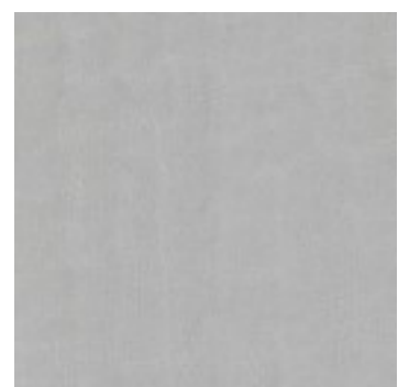
03959.022 LIGHT GREY