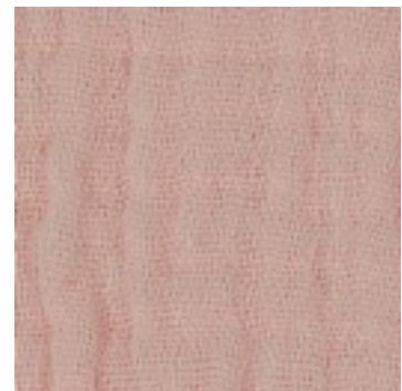
03959.007 OLD ROSE