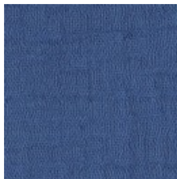
03959.078 MIDNIGHT BLUE