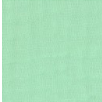
03959.072 LIGHT LIME