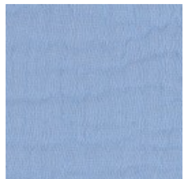
03959.055 LIGHT BLUE