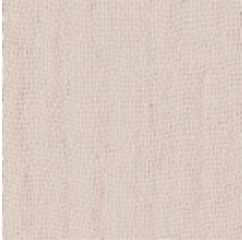
03959.021 LIGHT ROSE