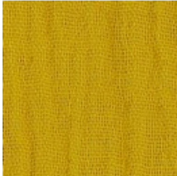
03959.023 DARK YELLOW