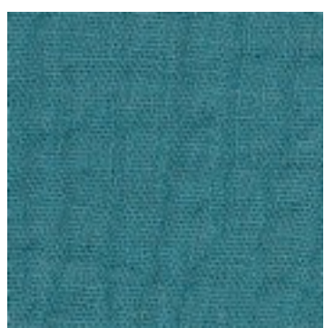
03959.038 BLUE SHADOW