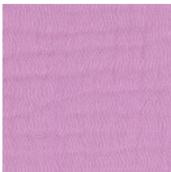
03959.065 LIGHT PINK