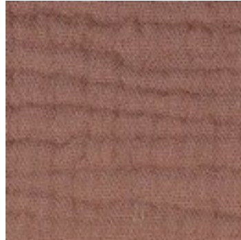
03959.048 OLD BLUSH