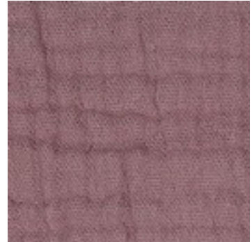
03959.049 LIGHT LILAC