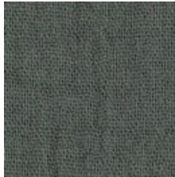
03959.002 DARK GREY