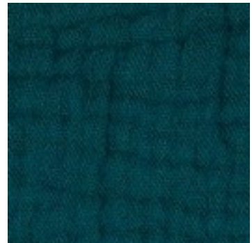
03959.052 DARK CYAN