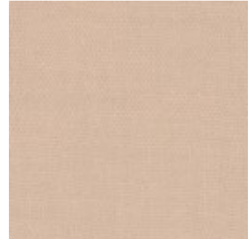
03959.025 LIGHT SALMON