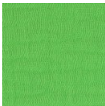
03959.069 LIME NEON