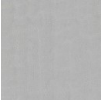
03959.022 LIGHT GREY