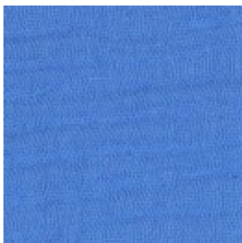
03959.077 ROYAL BLUE