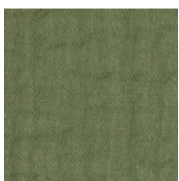
03959.041 MOSS GREEN