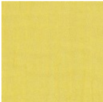
03959.026 SOFT YELLOW