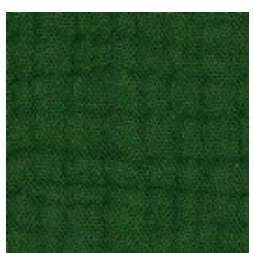
03959.042 DARK GREEN