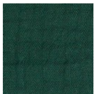
03959.040 OLD GREEN