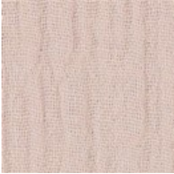
03959.015 SOFT ROSE