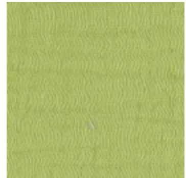
03959.064 OLD LIME