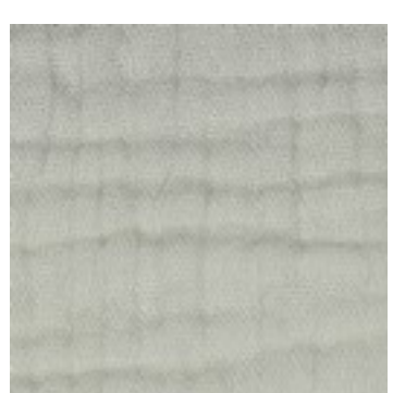
03959.045 LIGHT SAND