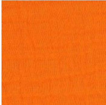
03959.071 ORANGE NEON