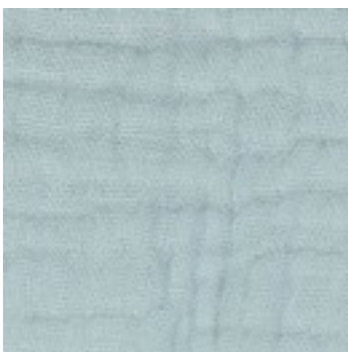
03959.053 BABY BLUE